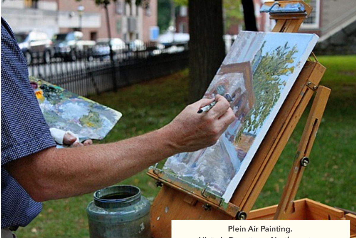
Plein Air Painting. Historic Downtown Northampton.