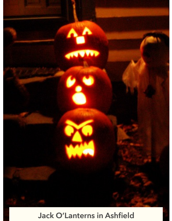
Jack O'Lanterns in Ashfield