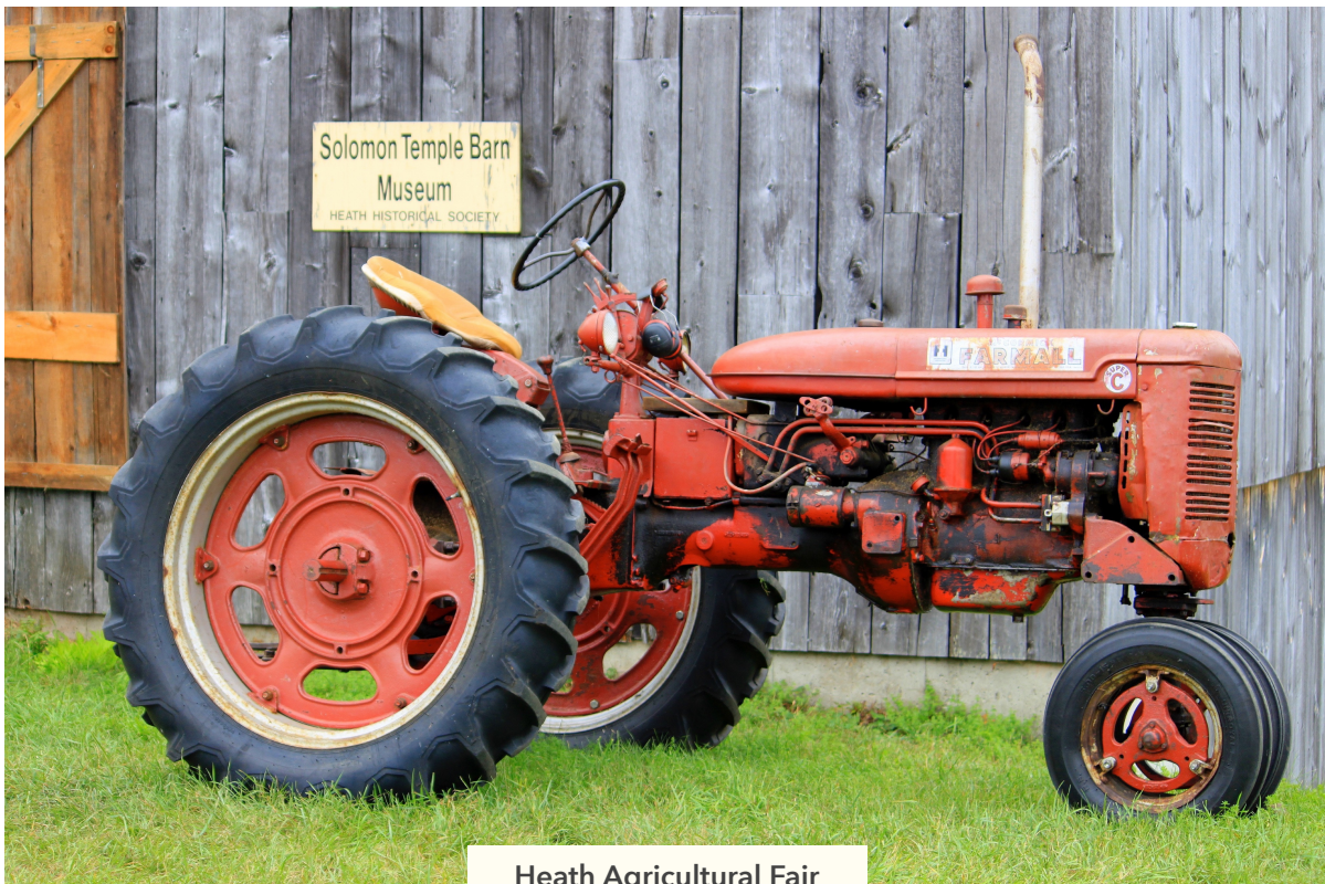
Heath Agricultural Fair

As summer winds down and signs of autumn appear, annual agricultural fairs throughout Western Massachusetts mark the season with celebrations of local culture through the lens of farming traditions. Beginning as early as August, these annual fairs honor the unique character of towns throughout our region, fostering community pride and strengthening intergenerational relationships through a shared interest and experience. With a stroll through exhibition halls on the fairgrounds and experiencing traditional skills, crafts, and customs, visitors can support their interests through various learning opportunities while cultivating relationships and strengthening a deeper sense of place.