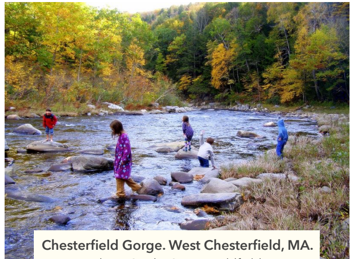
Chesterfield Gorge. West Chesterfield, MA.

This diversity of options inspires area naturalists and conservation-minded enthusiasts to lead guided walks, hikes, and river paddling trips, teaching the richness of our Hilltown landscapes and biodiversity.