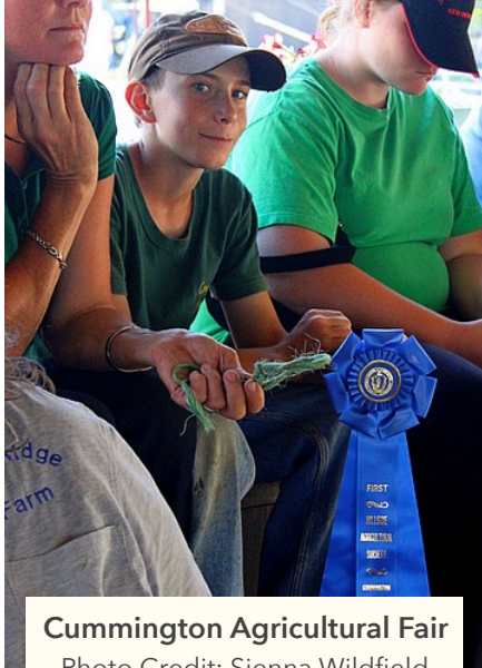
Cumington Agricultural Fair

Agricultural fairs help to preserve our local history by showcasing the skills, crafts and home-grown produce unique to rural life that have been cherished and passed on for generations. Through participation in these rich traditions we support the preservation of culture, local history, and a connection to place. The agricultural fair's long-standing presence in New England history reminds people of the importance of gathering to celebrate and share, even during difficult times, in order to foster a sense of community and collaborative spirit. Many fairs are over 150 years old and have even taken place during some of our country's most difficult economic periods and war time. These generations-old traditions of agriculture, self-sufficiency, and resiliency in rural communities