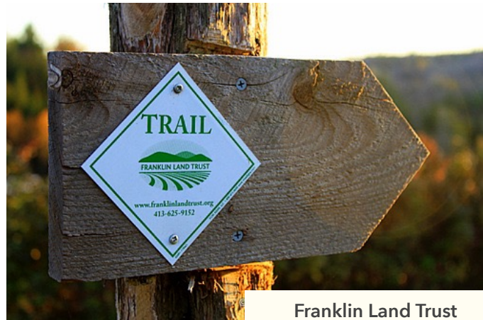
Franklin Land Trust Guyette Farm in Plainfield.