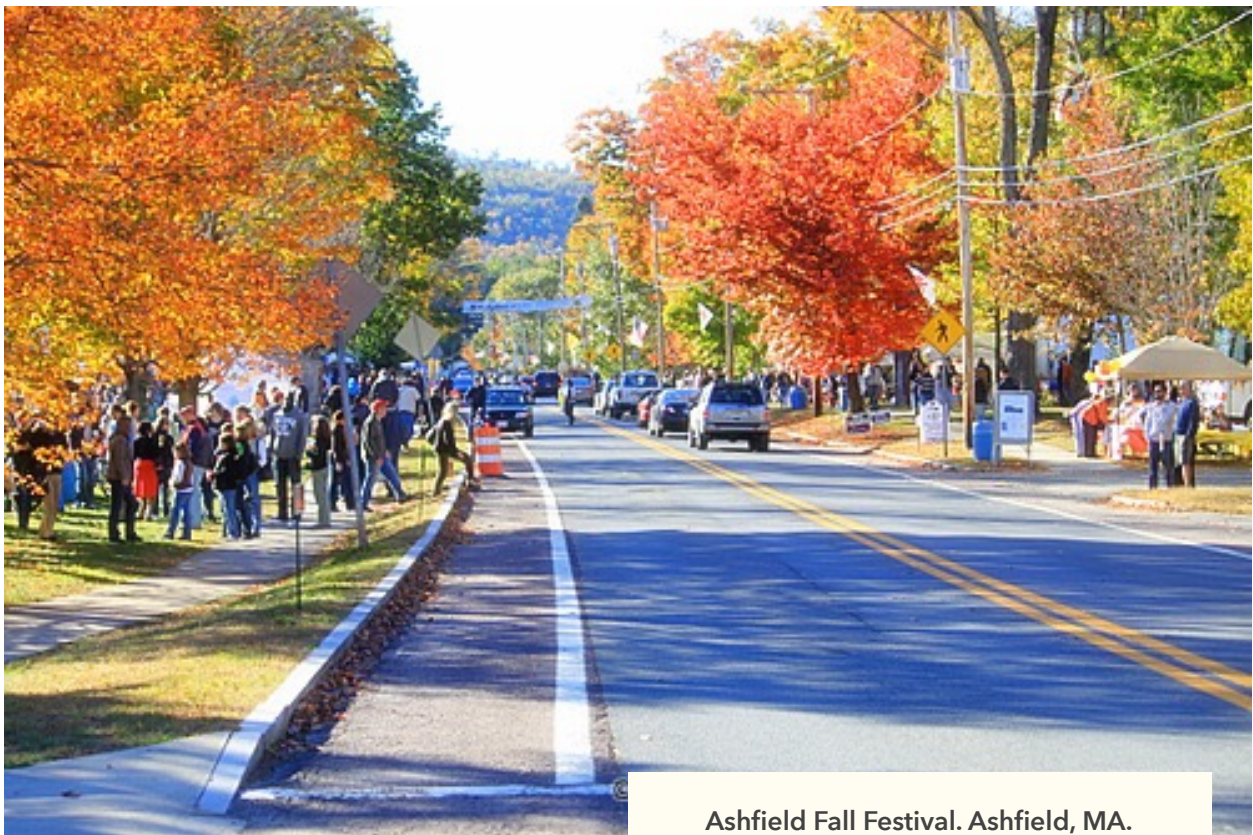
Ashfield Fall Festival. Ashfield, MA.