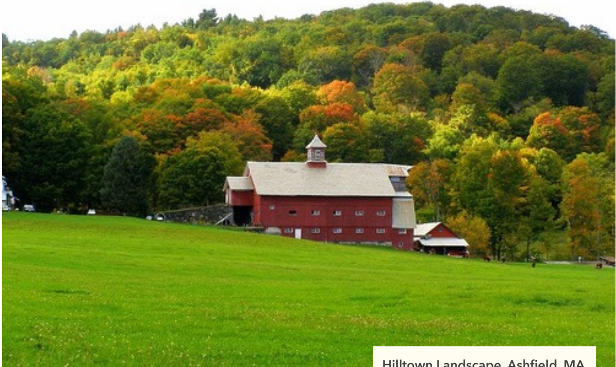
Hilltown Landscape. Ashfield, MA.