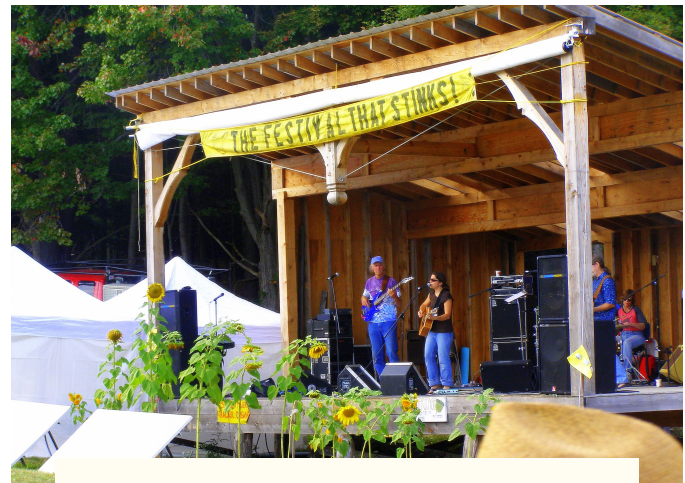
North Quabbin Garlic & Arts Festival

The first North Quabbin Garlic and Arts Festival was held in 1999 at Seeds of Solidarity Farm, later moved to Forster's Farm. There is so much at this festival that nourishes the soul: art, fall foliage, workshops, exhibits, food and more! As the website says, "[The Festival] is a celebration of the artistic, agricultural and cultural bounty of the region. The purpose of the festival is to unite North Quabbin people whose livelihoods are connected to the land and the arts, and to invite both local residents and those who do not live in the region to experience the richness of an area that is often overlooked..." - www.garlicandarts.org