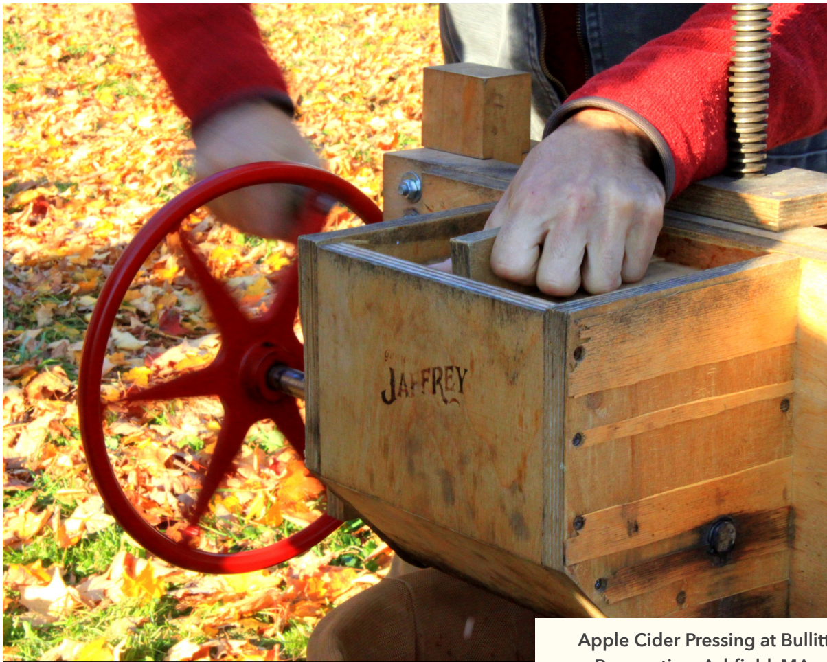
Apple Cider Pressing at Bullitt Reservation. Ashfield, MA.

Did you know the "golden apple" is a motif in folklore and tales? Look up the tale The Judgement of Paris in Greek mythology. To whom does the apple go in the myth? Why? What major event does this cause later that Homer writes about in The Iliad ? (Fun Fact: Did you know that Bryant translated The Iliad while in Cummington, MA?)