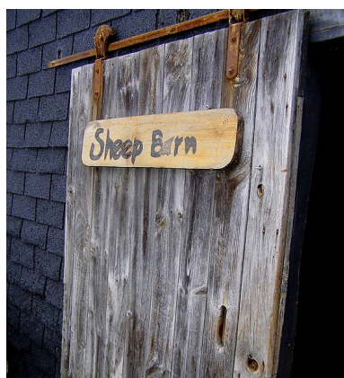
Sheep Barn at Red Gate Farm

Knitting is the production of many hands: from the sheep to the shepherd who raises and shears them, to the spinners at the wheel and the hands that knit the garment. Knitting celebrates this agricultural process and local fiber production in Western Massachusetts. In fact, in the 19th century there was a huge merino wool boom in the Hilltowns when farmers used their pasture land to raise merino sheep and meet the demand for this luxuriously soft wool. Now there are many breeds of sheep raised in the region and other fiber animals that produce different textured wools for making knitwear. At agricultural fairs, support an interest in knitting and textile arts by visiting with farmers and their animals, learning about different breeds, and then making your way to the exhibition hall to see some of the beautiful hand-knitted garments on display. Knitting, yarn dyeing, and spinning are a rich part of women's history in New England. The art of knitting and fiber dyeing offer a hands-on method for learning about design, color theory, farming, and even plant science via natural plant dyes.