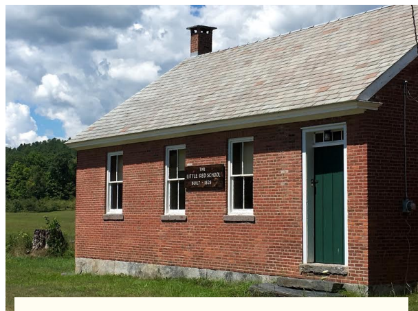
Little Red School in Charlemont, MA. Oldest One-Room Brick Schoolhouse in MA (built 1828)

19th century poet, John Greenleaf Whittier, wrote a poem that describes well a typical country schoolhouse in New England. A Quaker, abolitionist, and native of Haverhill, MA, Whittier is part of a group of poets also known as the schoolroom poets. Whittier, William Cullen Bryant, Henry Wadsworth Longfellow, James Russell Lowell, and Oliver Wendell Holmes Sr. were considered the first American poets to bring forth an authentic American voice and rival the British poets. They were referred to as the Schoolroom Poets, Fireside Poets, or Household Poets given