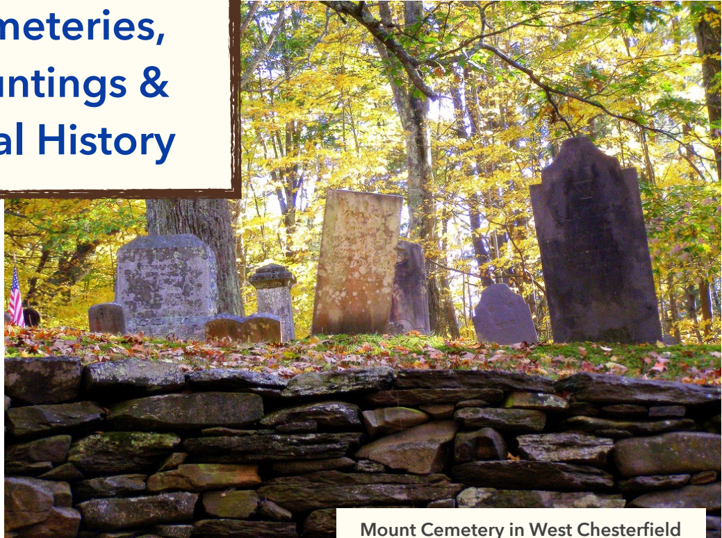
Mount Cemetery in West Chesterfield