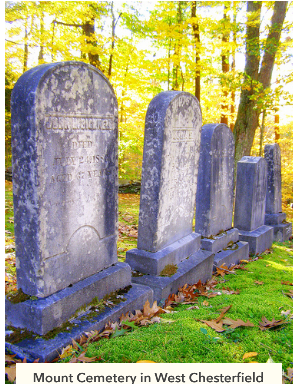
Mount Cemetery in West Chesterfield