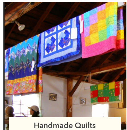
Handmade Quilts Cumington Agricultural Fair

Curious to know more about the history of quilts and their stories? Check out the Massachusetts Quilt Documentation Project at www.massquilts.org .