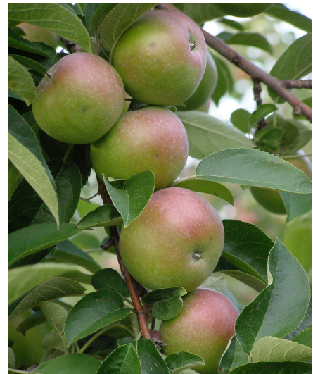
Quonquot Farm. Whately, MA.

Finally, in this particular stanza, the last few verses "And sojourners beyond the sea/ Shall think of childhood's careless day/And long, long hours of summer play,/In the shade of the apple-tree" again speak to the connection Bryant has established between the apple and the idea of "home" as felt by American travelers abroad.