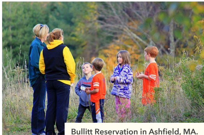
Bullitt Reservation in Ashfield, MA.

At the William Cullen Bryant Homestead explore old growth forest on the Rivulet Trail. This same woods inspired Bryant to write his 1823 poem "The Rivulet." This poem and other nature poetry by Bryant are placed on interpretive displays along the trail for visitors to read. Bring along your notebook to contribute your own poetic musings too!