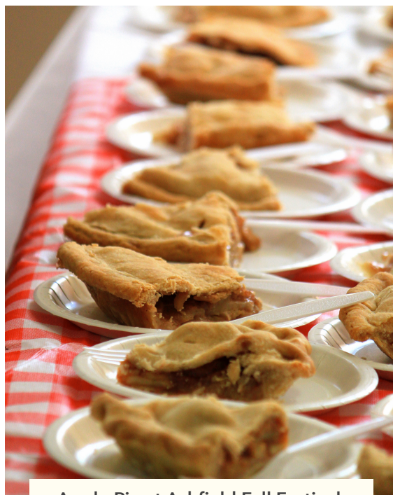
Apple Pie at Ashfield Fall Festival.

When you make apple pies, stew your apples very little indeed; just strike them through, to make them tender. Some people do not stew them at all, but cut them up in very thin slices, and lay them in the crust. Pies made in this way may retain more of the spirit of the apple; but I do not think the seasoning mixes in as well. Put in sugar to your taste; it is impossible to make a precise rule, because apples vary so much in acidity. A very little salt, and a small piece of butter in each pie, makes them richer. Cloves and cinnamon are both suitable spice. Lemon brandy and rose-water are both excellent. A wine-glass full of each is sufficient for three or four pies. If your apples lack spirit, grate in a whole lemon. (p.67-68).