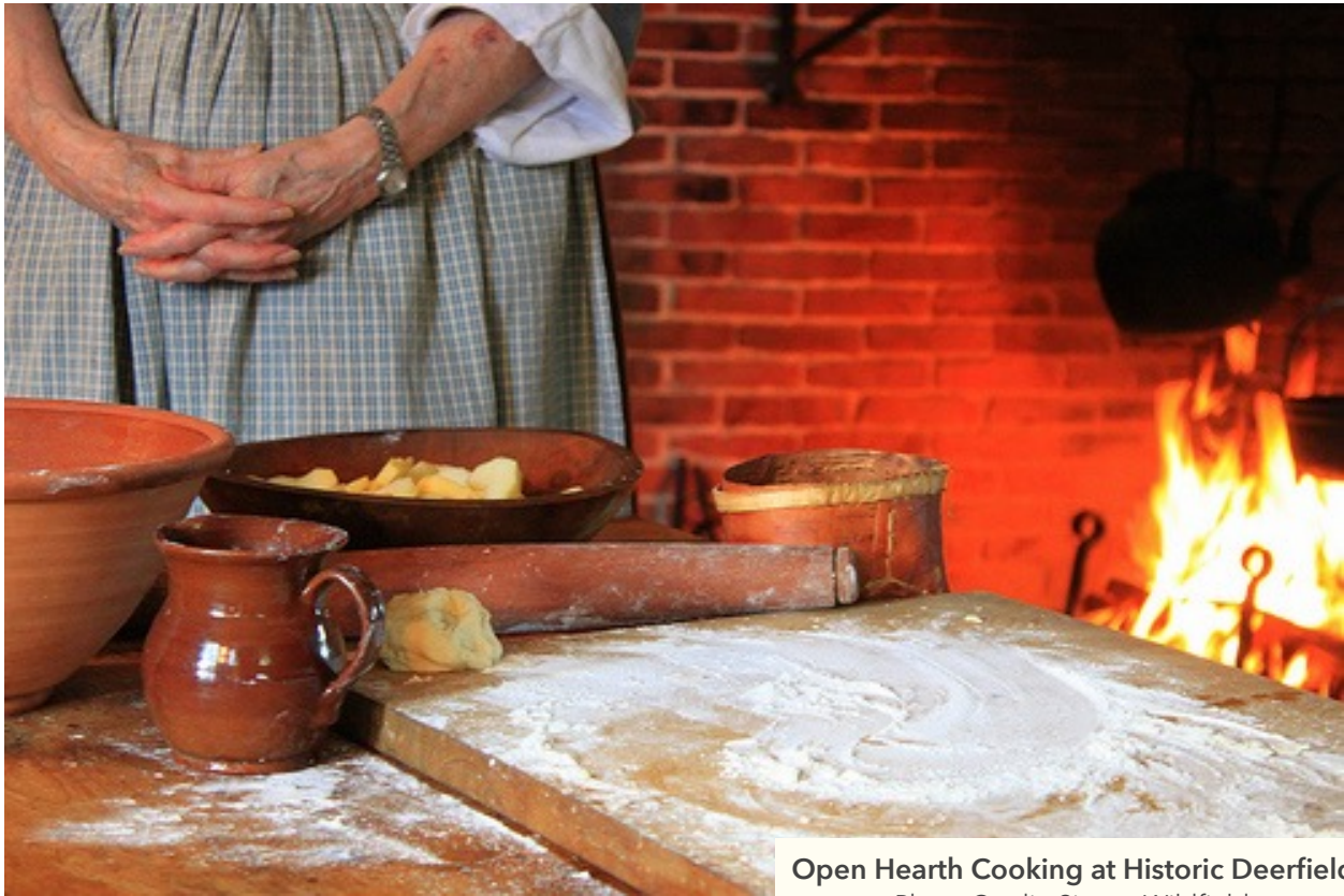
Open Hearth Cooking at Historic Deerfield