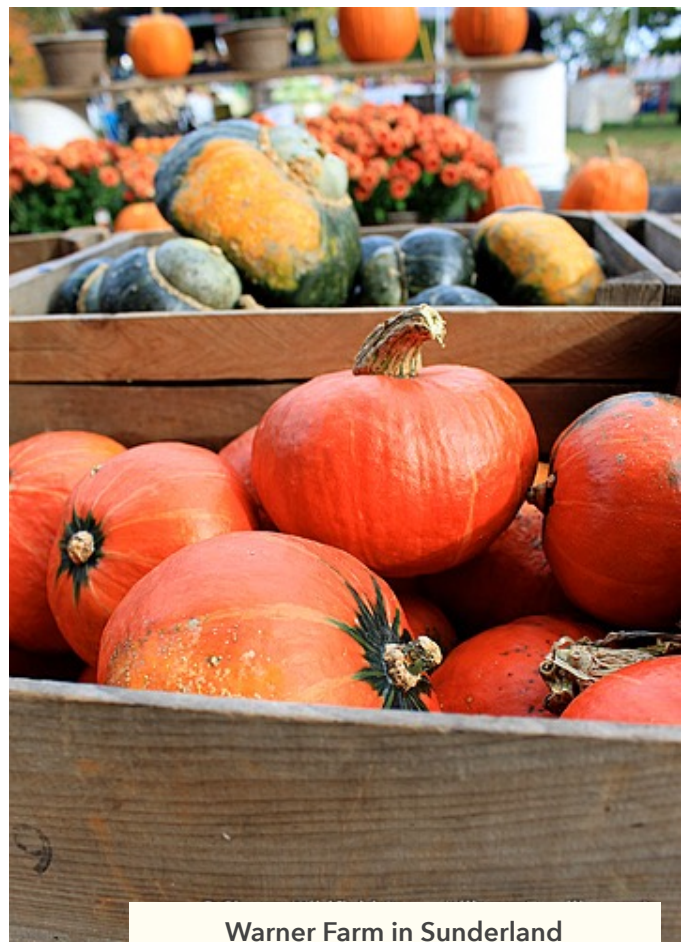
Warner Farm in Sunderland