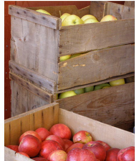
Clarkdale Fruit Farms. Deerfield, MA

Bashista Orchards - Southampton, MA www.gotcider.net