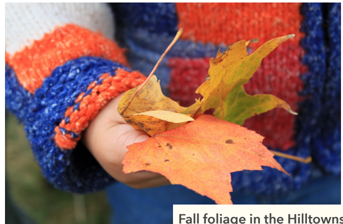
Fall foliage in the Hilltowns