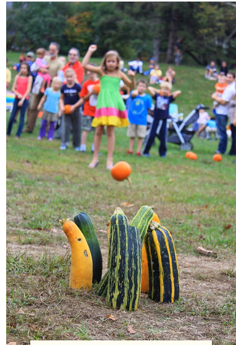
Pumpkin games at the Ashfield Fall Festival.

Since 1969, the Ashfield Fall Festival takes place on Ashfield's charming main street and throughout the town every Columbus Day weekend, celebrating town culture, artisans, and Ashfield businesses. The annual giant pumpkin and tallest sunflower contests are something to be seen, along with an intergenerational round of pumpkin games! On the town common, carnival games initiated and facilitated by Ashfield youth take place, giving them an opportunity to develop their creative, social, and business skills in a real world application while contributing to their local culture. Admission is free to this two-day event, happening rain or shine. - www.ashfieldfallfestival.org