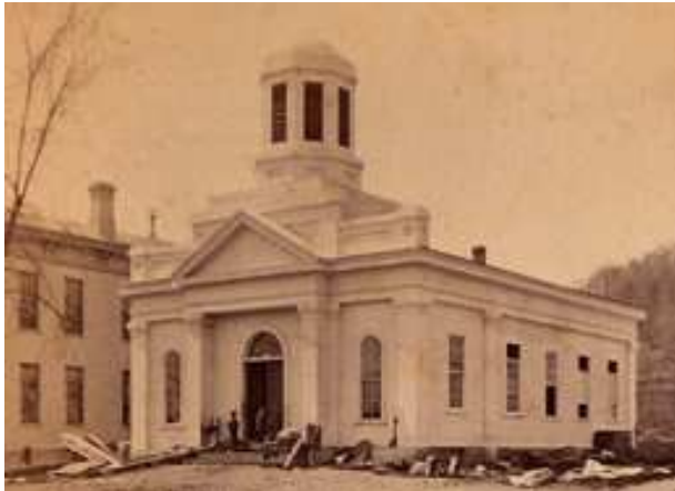
Town Hall built 1841

11:00 – 3:00 Sat 6/2 and Sun 6/3 - All Three Museums of the Williamsburg Historical Society will be open: The Old Town Hall Museum at 8 Main St.; The Grist Mill Farm Museum on Mill St.; The 1786 Nash District School at 117 Nash Hill Rd.