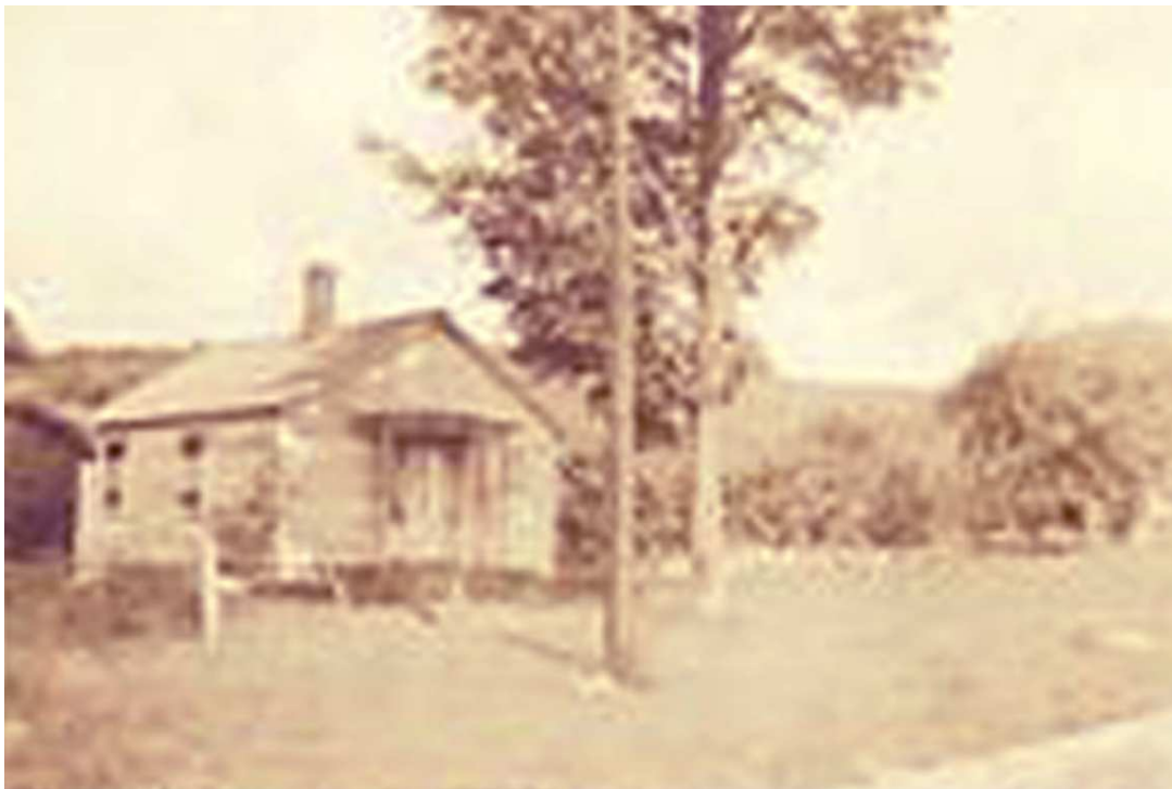
Nash District Schoolhouse

A short reenactment of what a class session might have looked like 150 years ago in the one-room at the Nash Hill Schoolhouse at 117 Nash Hill, Starring neighborhood schoolers.