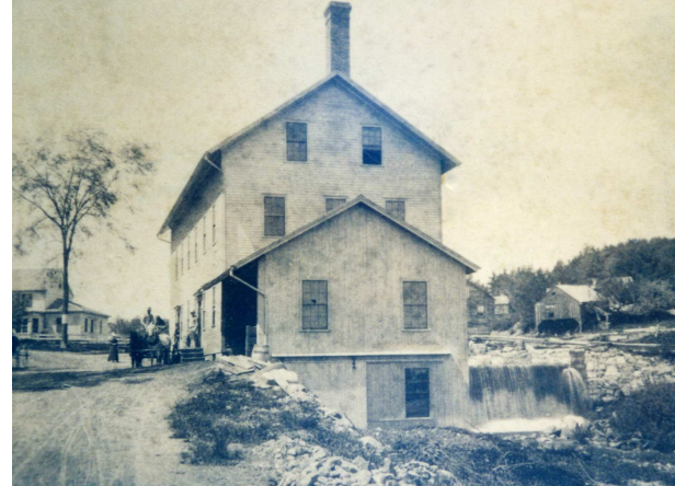
Grist Mill built 1883